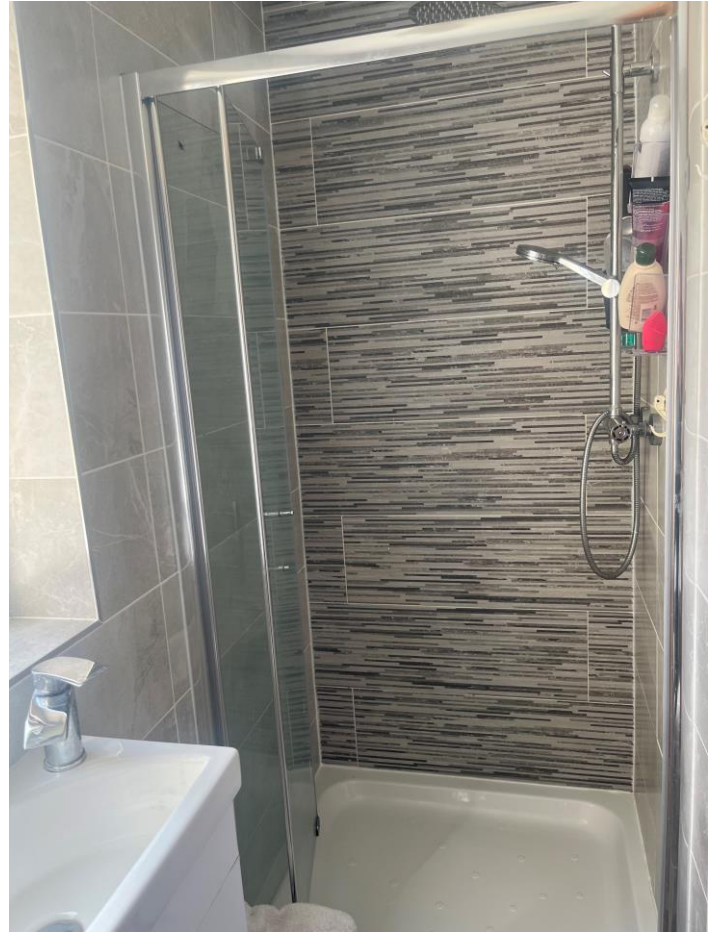
Bathroom: 2.5 x 1.7 tiled floor, w.c., whb & bath.