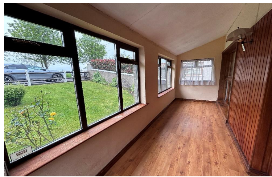
Hallway: 3.3 x 2.5